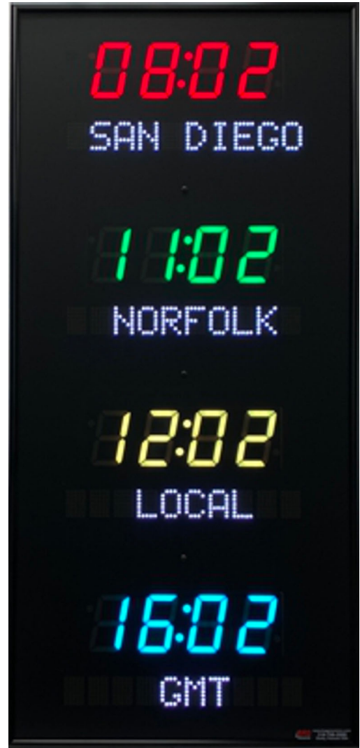
Model 3010H - 2.5" time, 1.2" zone labels, 4 zones